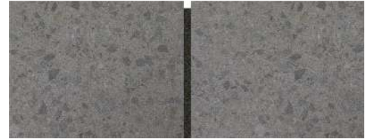
PAVERS OR NATURAL STONES WITHOUT CHAMFER