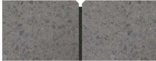
PAVERS WITH CHAMFER

THIS CROSS-SECTION REPRESENTS THE HEIGHT OF POLYMERIC SAND FOUND IN THE JOINTS